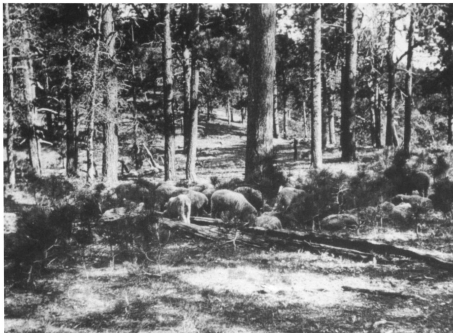
Figure 3. Sheep Grazing Pine Seedlings under the Mogollon Rim. Sheep browsing new pine growth proved particularly objectionable to foresters.

the concurrent damage of forage and forest depletion sheep caused, nor the importance of fire in renewing range grasses. 30