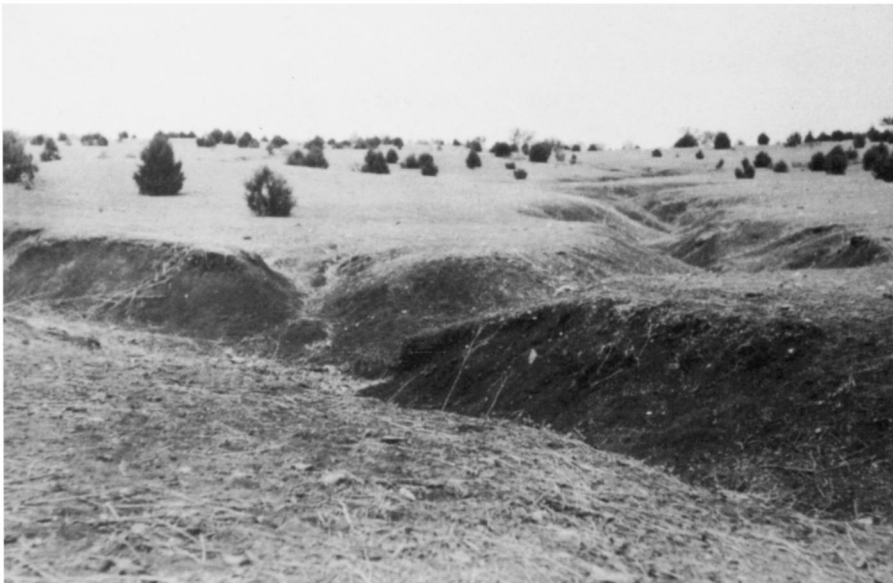
Figure 2. Erosion in Pleasant Valley. This photograph demonstrates the eroding effects of overgrazing.

It is clear that the water needs of the expanding population in the Salt River Valley caused forestry experts to focus on watershed protection. Since overgrazing exacerbated erosion and lowered the water table, valley farmers sought to limit the ranching economy in the Tonto by encouraging stock reductions or exclusions (see figure 2). The rivalry sharpened as Phoenix farmers began incriminating Tonto ranchers. Valley settlers perceived grazing and the potential for increased lumbering on Tonto as major threats to their water supply. Irrigation farmers believed their water supply was dwindling and in 1904, requested that S. J. Holsinger, a General Land Office official, study Tonto to determine the watershed's condition. The farmers alleged the forage to be in a depleted state because of heavy grazing. Holsinger explained the farmers' perceptions, "The decrease in the supply of water for irrigation was variously attributed to, drouth [sic], denudation of forested lands by lumbering operations, cattle and sheep grazing and other minor causes." Valley residents had expected Holsinger's expert testimony to point to Tonto livestock as the thieves of valley water and immediately to advocate forest reservation and reduction or elimination of stock. But Holsinger balked and refused to recommend the forest reservation at all. 23