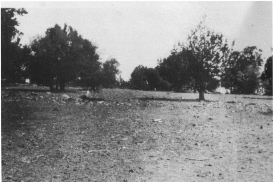
Figure 4. A Portion of the Heber-Reno Trail. The photo illustrates the environmental consequences of sheep grazing along a well-traveled route for transhumance.

Although range deterioration was a principal concern, others emphasized the region's long-term integrity and stability. The sheep industry threatened the community that cattle ranchers had already